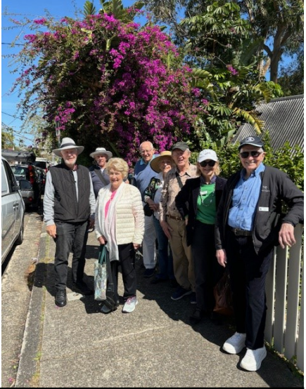
The Renada and Crew, 29 Nov

The On Course coach will depart at 8:30 am from outside Norths Cammeray on Wednesday 20th November 2024. Please remember to bring your name badge with you! Ian Doig