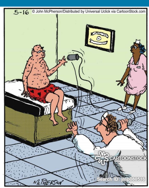
"Here! Put this up to your chest while I take a listen. I don't want to catch whatever the heck you've got."