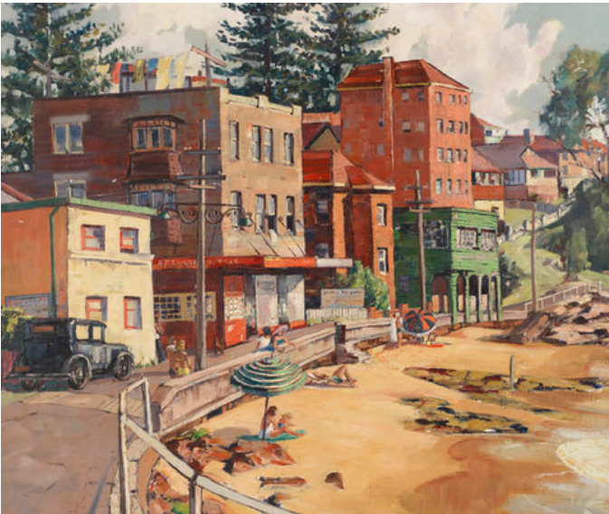
One of the beautiful paintings on display at the State Library

Tony Bowra 0410 840 077 Bob Pearce 0400 291 373