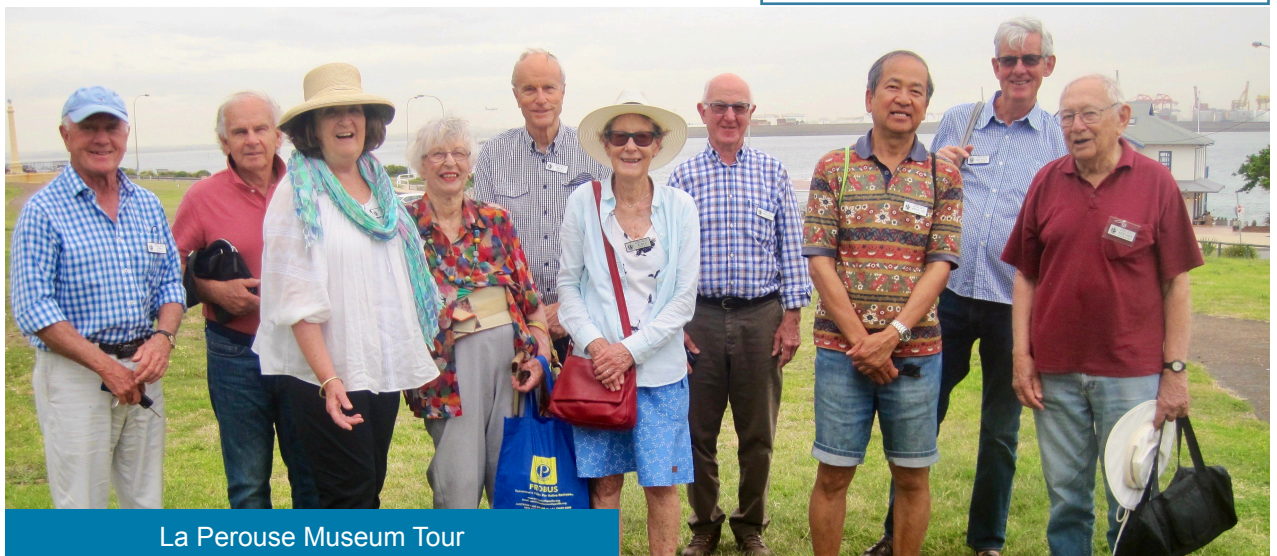
La Perouse Museum Tour