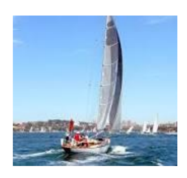
Caprice of Huon